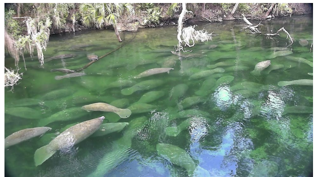
Manatee aggregation filmed with the above water camera at Blue Spring.