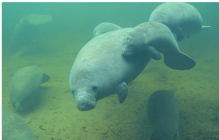
A manatee cow and calf are monitored with the underwater camera at Blue Spring.

In collaboration with the Florida Park Service, Save the Manatee Club established above- and underwater webcams at the park at the beginning of the 2011/2012 winter season. The AXIS PTZ cameras can be watched live by viewers from around the world (ManaTV.org), but they also have significant impact for our research. While we are able to gather a lot of important data on individual manatees, reproduction, rapid growth of calves, and boat strikes acquired during the winter season during the morning roll calls, the webcams have provided a unique opportunity for monitoring behavior of individuals, determining gender of calves, and assessing sick and injured manatees.